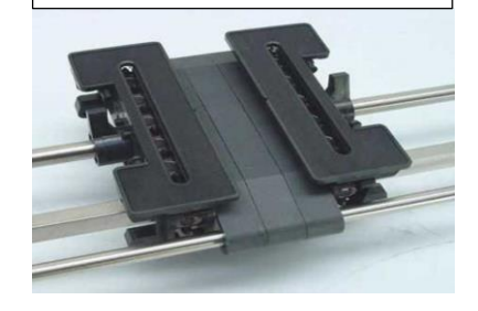
Paper Feed Tractors