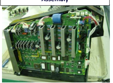
PHPMC/Backplane Logic Board Assembly

Note : Printronix continues to support printer ribbons for the products mentioned above.