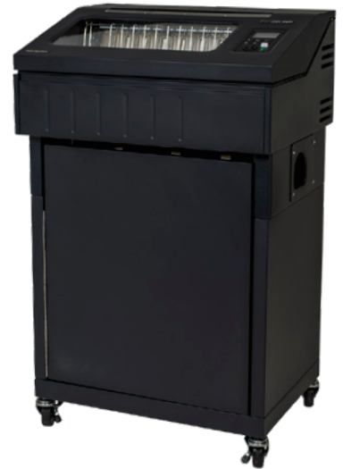
Zero Tear for on-demand printing without forms waste.

Only Line Matrix offers proven high reliability, uptime performance and environmental responsibility. All delivered by the power of OpenPrint from Printronix.