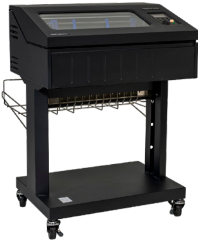
Open Pedestal for easy forms access with a small, maneuverable footprint.