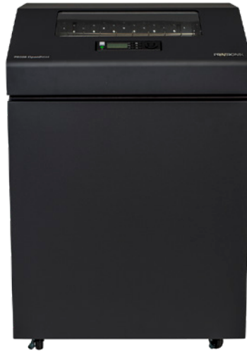
Quiet Cabinet for large, unattended and secure print jobs.